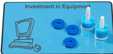
A pic of a small part of one of our games