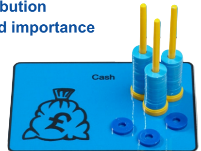
A pic of a small part of one of our games