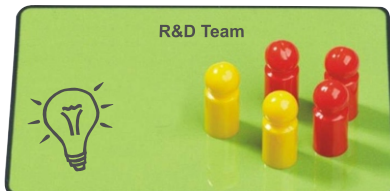
A pic of a small part of one of our games

“A great team event with fantastic networking opportunities”*